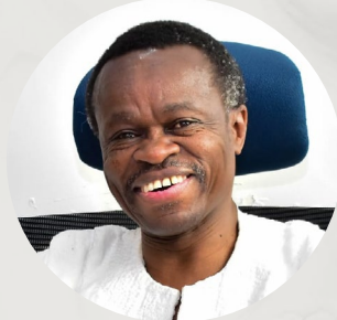
Prof. Patrick Lumumba Advocate of the High Courts of Kenya KeyNote Speaker