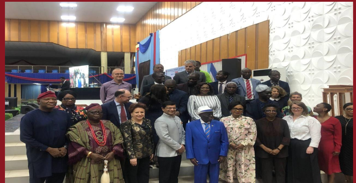
ABUAD signs MoU with King's College , London on Affordable Access to Education

A sum of 10 Billion Naira (10 Million Pounds was endowed to King's College, London, UK to provide transnational education access to indigents youth in Africa.). Substantial discounts were provided to Low income household students to have access to education via the part-time and open distant learning platform