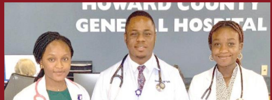
ABUAD Medical Students at John Hopkins Hospital, USA