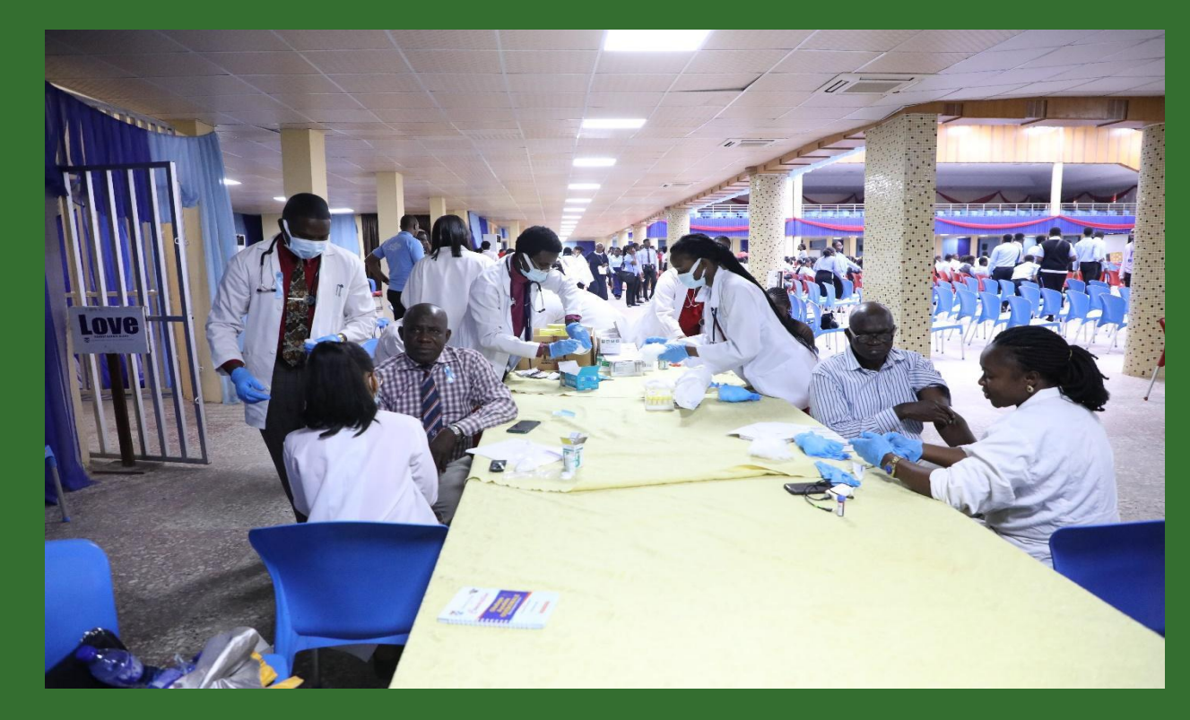
Free medical assessment at the World Diabetes Day 2022

The concerted efforts by ABUAD, through its Multisystem Hospital and various health programs, demonstrate a strong alignment with SDG 3's targets. ABUAD's achievements in high-quality medical care, innovative health solutions, environmental health advocacy, and disease prevention initiatives have not only bolstered the local health infrastructure but have also contributed significantly to the global pursuit of health and well-being for all.