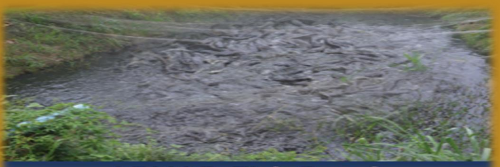
ABUAD Fish Pond

The ABUAD Agricultural Enterprise Centre is a testament to the institution's commitment to Sustainable Development Goal 2: Zero Hunger. With its 800 fishponds, extensive tree plantations, and multifaceted livestock and honey farms, the centre embodies an integrated approach to agriculture. The initiative ensures a steady supply of diverse food products while maintaining ecological balance through practices like agroforestry, signifying a stride toward sustainable farming practices.