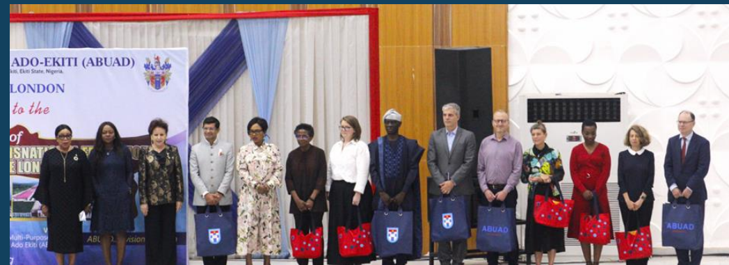
Wife of the Founder, the Vice-Chancellor, the Registrar with representatives from King's College, London.

Through its diverse range of partnerships and collaborative efforts in legal education, medical training, international conferences, and educational programs, ABUAD has significantly contributed to the advancement of SDG 17: Partnerships for the Goals. The university's initiatives from 2022 to 2023 highlight its dedication to establishing global partnerships that enhance its educational offerings, enrich its students' experiences, and contribute to sustainable development both locally and internationally.