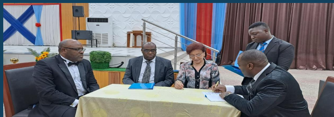
ABUAD Vice Chancellor signing the agreement with representatives of John Hopkins Hospital and Little-By-Little Foundation

A landmark achievement in medical education was the Tripartite Medical Training Agreement signed in 2022 involving John Hopkins Hospital, USA, Little-by-Little Foundation, and ABUAD. The agreement facilitates additional clinical training at John Hopkins Hospital for select 500-level Medical Students from ABUAD. This initiative began in 2021 and consummated in 2022 with four groups of three qualified students traveling to the USA each quarter for training.