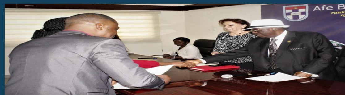
The Founder and the VC receiving the selected students that just returned from the John Hopkins University training programme in USA.