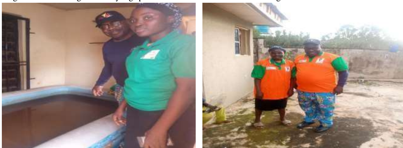
Figure 9: Monitoring of Fishery Agripreneurs from 2021 UNESCO Training

The sixteen youths trained in fishery, Moringa and mango production and processing, and Fabrication, as well as those empowered with fumigation equipment and cash grants, will be monitored from time to time, to ensure that they are using their skills and empowerment materials as expected. They have been instructed to contact us if they need any additional assistance, and we will continue to provide support for them as opportunity and resources dictates. The UNESCO Chair monitored some of the Agripreneurs trained in the April 2020 to March 2021 as shown in Figure 5 below: