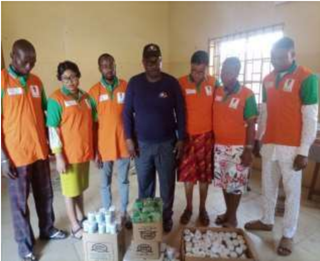
Figure 7: Trainees with their products – Moringa and Mango Value Added Products

The 16 youths were trained in August/September 2021. They had both online and inclass/hands-on training in their respective areas of interest – fishery, Moringa products, Mango production and Fabrication. The online and on-site training was employed for small numbers of training in batches, and then roundup with the graduation and award ceremony where grant certificate awards were issued. On-site training was for eight days in fisheries, Moringa, Mango and fabrication as shown in table 2 and depicted in the following figures: