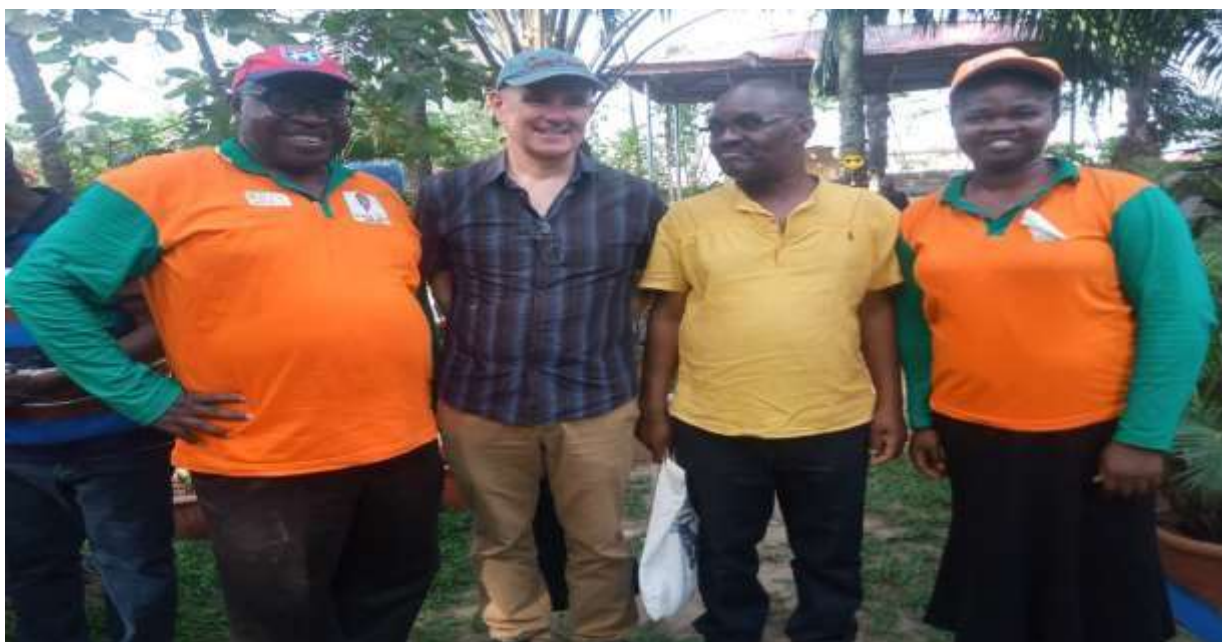
Figure 6: Forestry Training Workshop Session at Alfa Belgore Hall in ABUAD