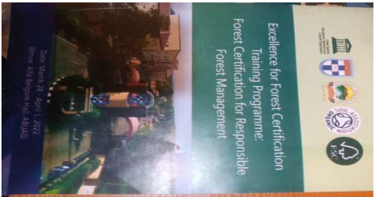
Figure 2: Forest Certification Training Workshop