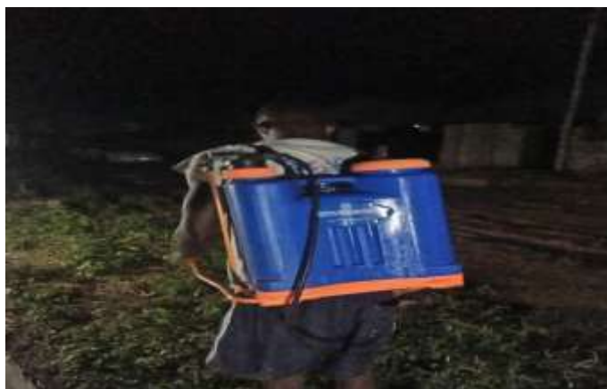
Figure 3: 20-Liters Kilnelco Knapsack Sprayer