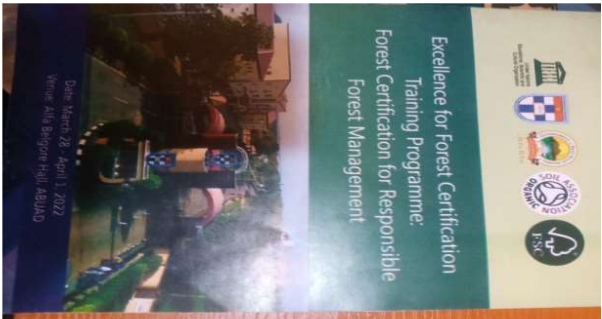
Figure 2: Forest Certification Training Workshop