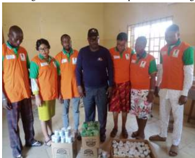
Figure 7: Trainees with their products – Moringa and Mango Value Added Products

The 16 youths were trained in August/September 2021. They had both online and in-class/hands-on training in their respective areas of interest – fishery, Moringa products, Mango production and Fabrication. The online and on-site training was employed for small numbers of training in batches, and then roundup with the graduation and award ceremony where grant certificate awards were issued. On-site training was for eight days in fisheries, Moringa, Mango and fabrication as shown in table 2 and depicted in the following figures: