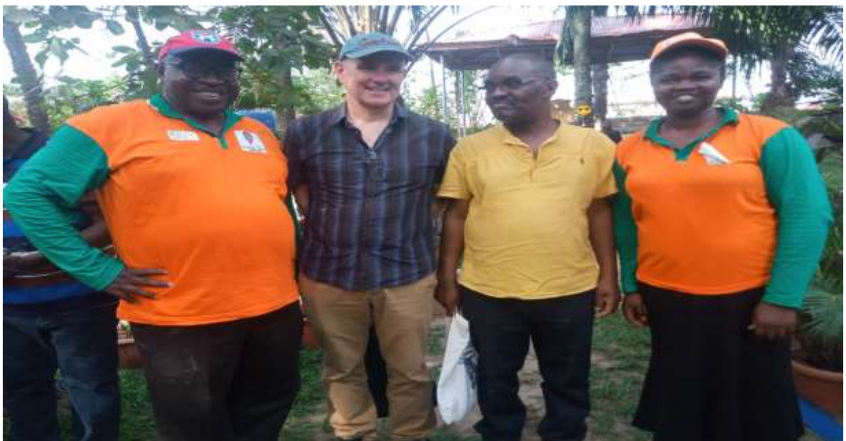
Figure 6: Forestry Training Workshop Session at Alfa Belgore Hall in ABUAD