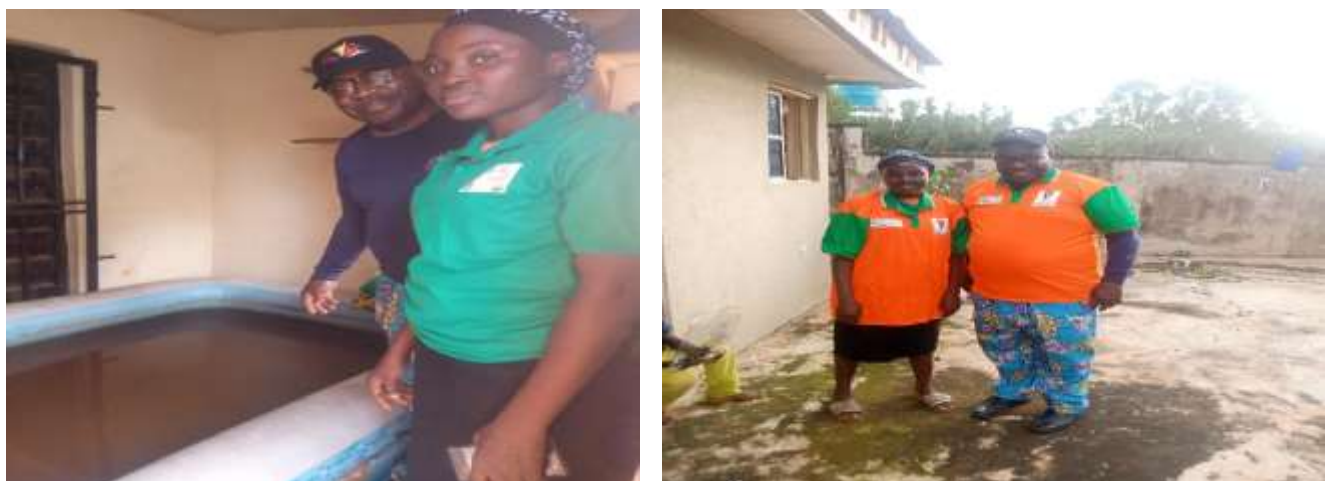
Figure 9: Monitoring of Fishery Agripreneurs from 2021 UNESCO Training

The sixteen youths trained in fishery, Moringa and mango production and processing, and Fabrication, as well as those empowered with fumigation equipment and cash grants, will be monitored from time to time, to ensure that they are using their skills and empowerment materials as expected. They have been instructed to contact us if they need any additional assistance, and we will continue to provide support for them as opportunity and resources dictates. The UNESCO Chair monitored some of the Agripreneurs trained in the April 2020 to March 2021 as shown in Figure 5 below: