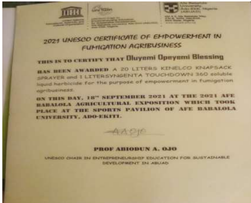
Figure 8: UNESCO Certificate of Empowerment in Fumigation Agribusiness