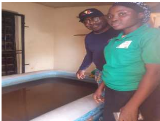
Figure 9: Monitoring of Fishery Agripreneurs from 2021 UNESCO Training

The sixteen youths trained in fishery, Moringa and mango production and processing, and Fabrication, as well as those empowered with fumigation equipment and cash grants, will be monitored from time to time, to ensure that they are using their skills and empowerment materials as expected. They have been instructed to contact us if they need any additional assistance, and we will continue to provide support for them as opportunity and resources dictates. The UNESCO Chair monitored some of the Agripreneurs trained in the April 2020 to March 2021 as shown in Figure 5 below: