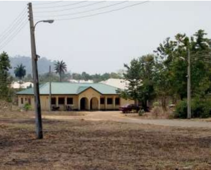
Some of the Prison's infrastructures.