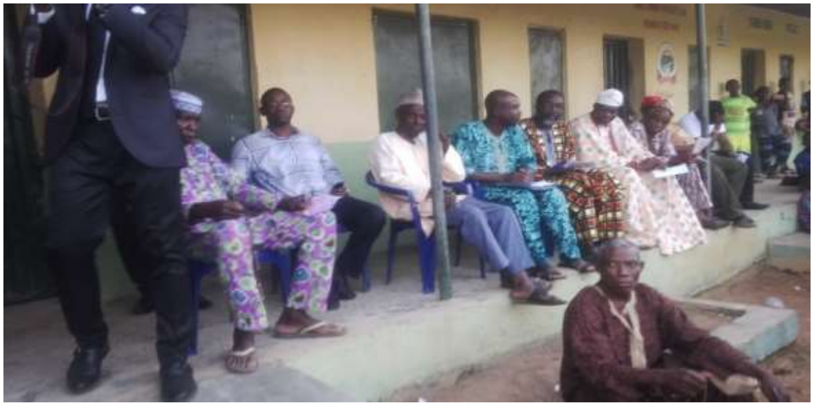
A cross section of participants at the sensitization