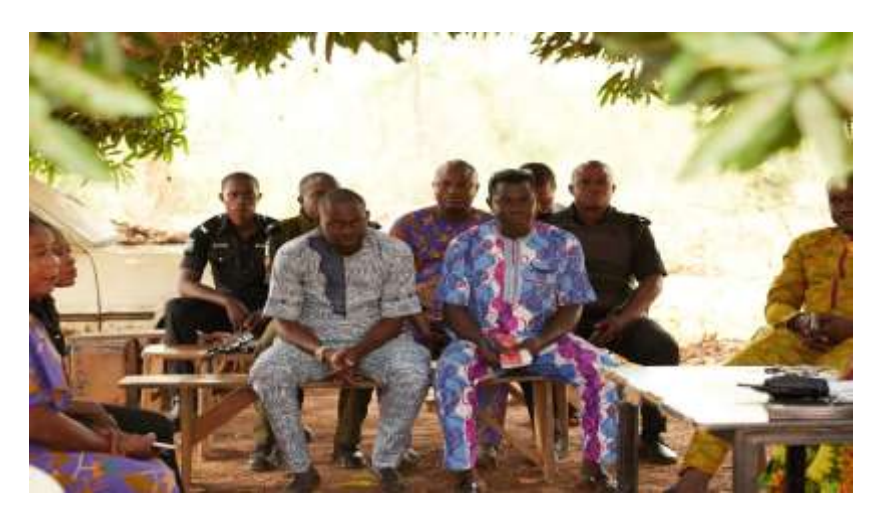
Police officers listening to and watching the presentation

At that seminar, a talk was also delivered by the Administrator of the Law Clinic concerning the new provisions contained in the Law. He emphasized on the need to inform suspects about the crime they are alleged to have committed as well as their rights to remain silent and to counsel at the point of arrest. Twenty police officers were in attendance including the highest ranking officer at the station, the Divisional Police Officer (DPO).