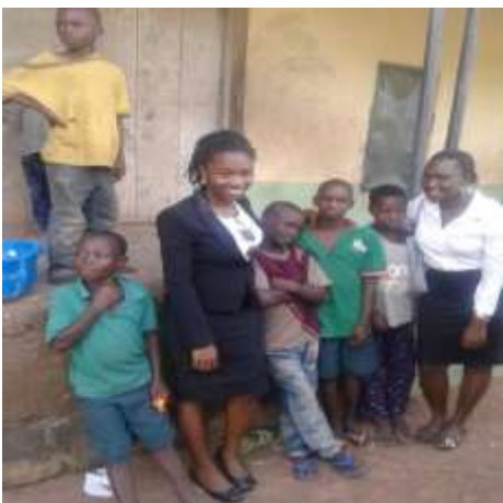
Student clinicians posing for a snap shot with children in the community