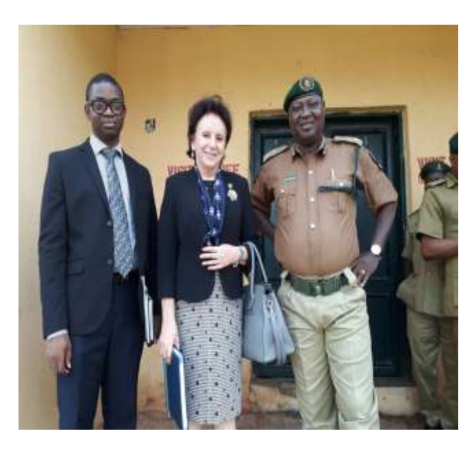
The Vice Chancellor flanked by the Director of the Law Clinic and the Deputy Controller of Prisons