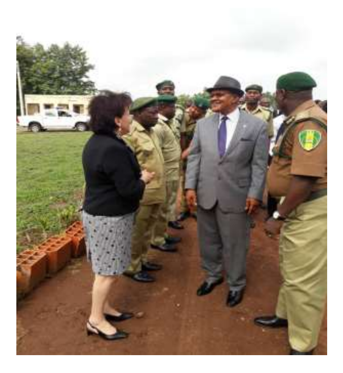
The Vice Chancellor, ABUAD and Former Director of the ABUAD Law Clinic