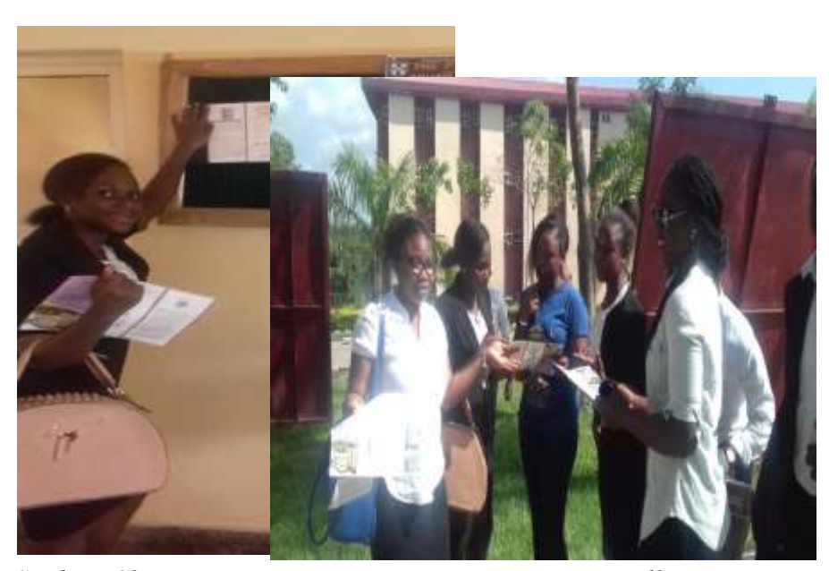
Student-Clinicians carrying out sensitization among colleagues