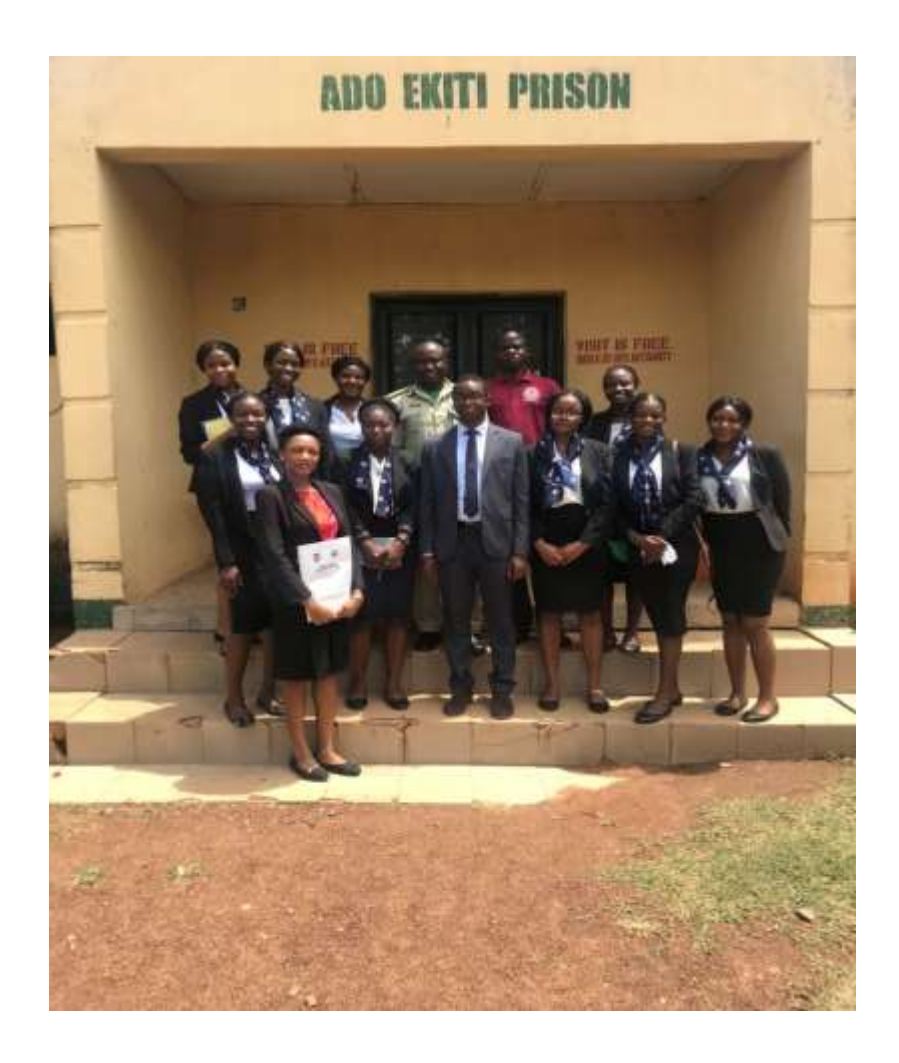
Staff & Student-Clinicians at Ado-Ekiti Prisons