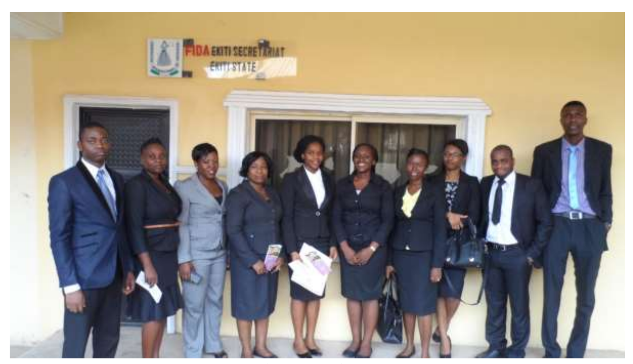
ABUAD clinicians and Executives of FIDA

FIDA agreed to collaborate with the ABUAD Law Clinic in the area of workshop as it has agreed to invite and carry clinicians along in the FIDA week. The Association has also agreed to collaborate in the area of ADR by allowing students participate in mediation sessions taking place at their office. The Law Clinic may, subject to the approval of relevant authorities, seize the opportunities made available by FIDA.