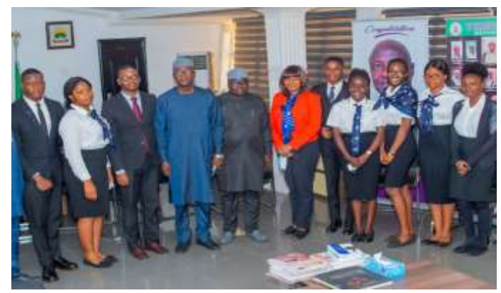
Staff and student-clinicians and Principal Members of the Ekiti State House of Assembly