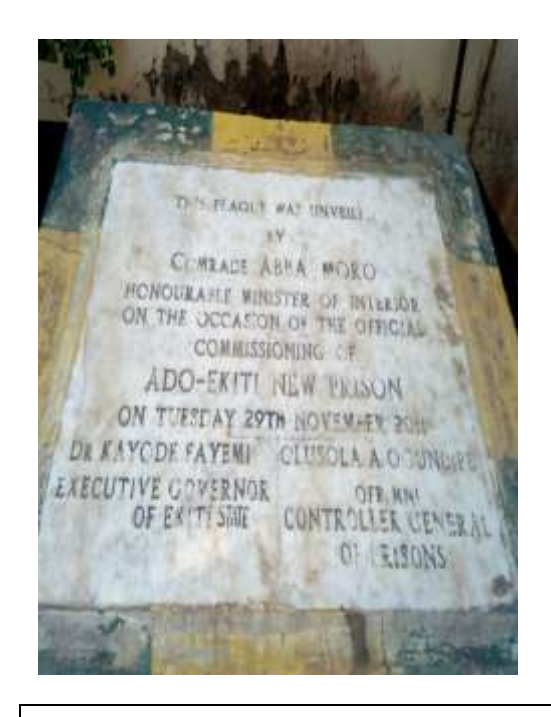
Nigerian Prison Service, Ado-Ekiti