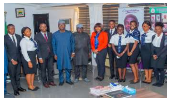
Staff and Student-Clinicians and Principal Members of the Ekiti State House of Assembly