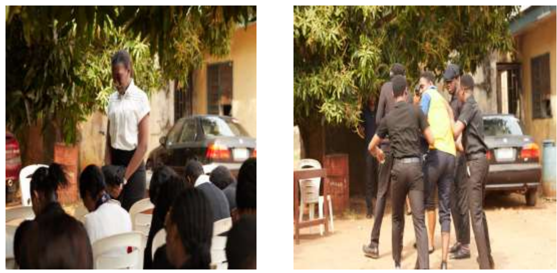
Student-clinicians dramatizing the rights of suspects