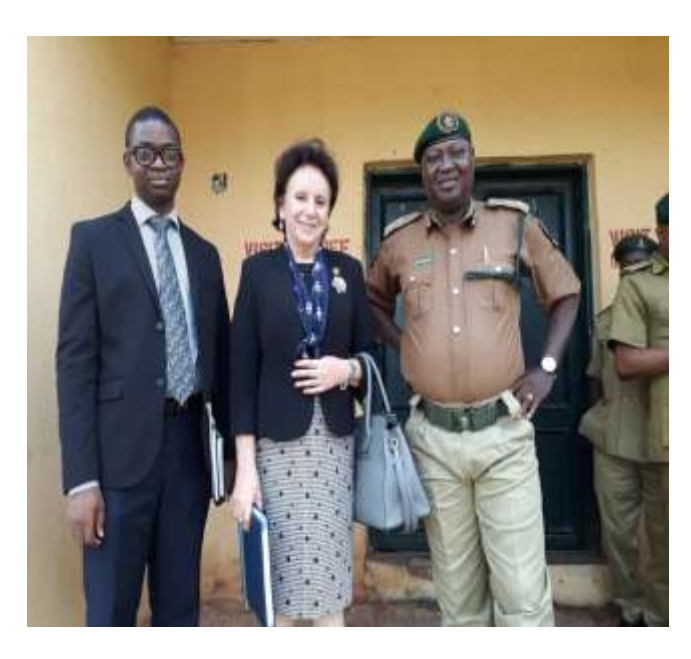
The Vice Chancellor flanked by the Director of the Law Clinic and the Deputy Controller of Prisons