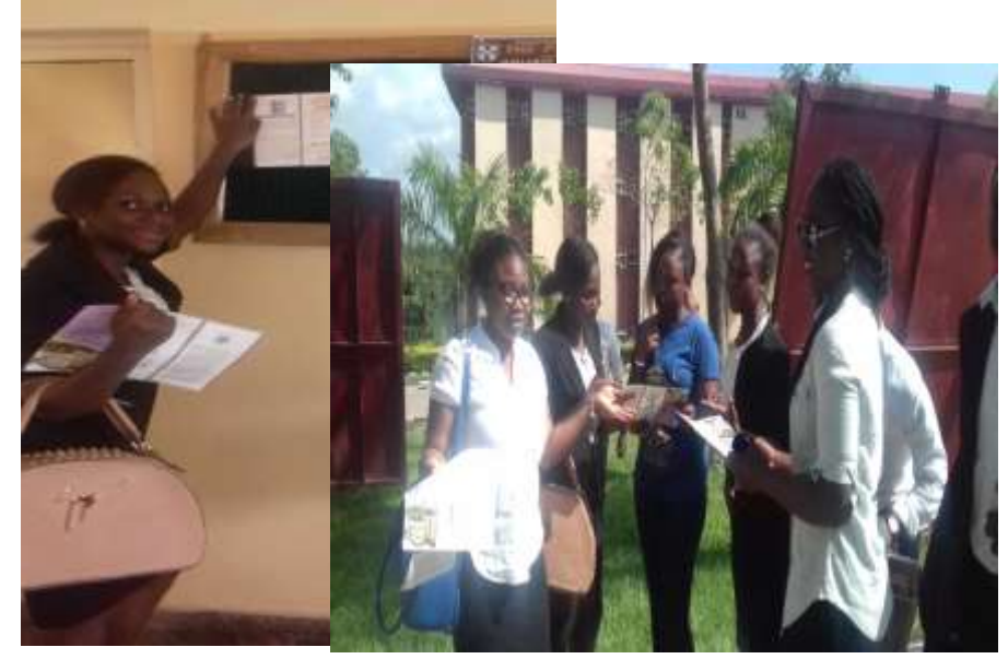
Student-Clinicians carrying out sensitization among colleagues