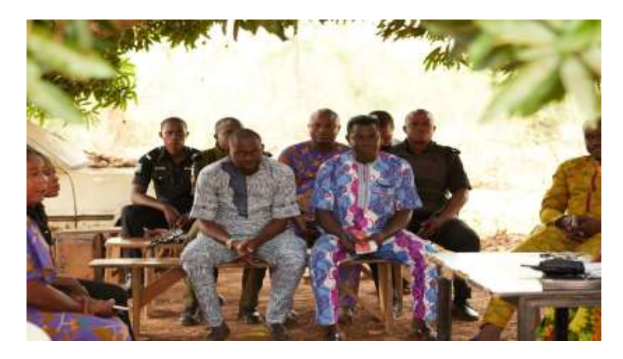
Police officers listening to and watching the presentation

At that seminar, a talk was also delivered by the Administrator of the Law Clinic concerning the new provisions contained in the Law. He emphasized on the need to inform suspects about the crime they are alleged to have committed as well as their rights to remain silent and to counsel at the point of arrest. Twenty police officers were in attendance including the highest ranking officer at the station, the Divisional Police Officer (DPO).