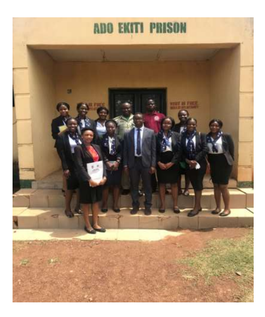
Staff & Student-Clinicians at Ado-Ekiti Prisons