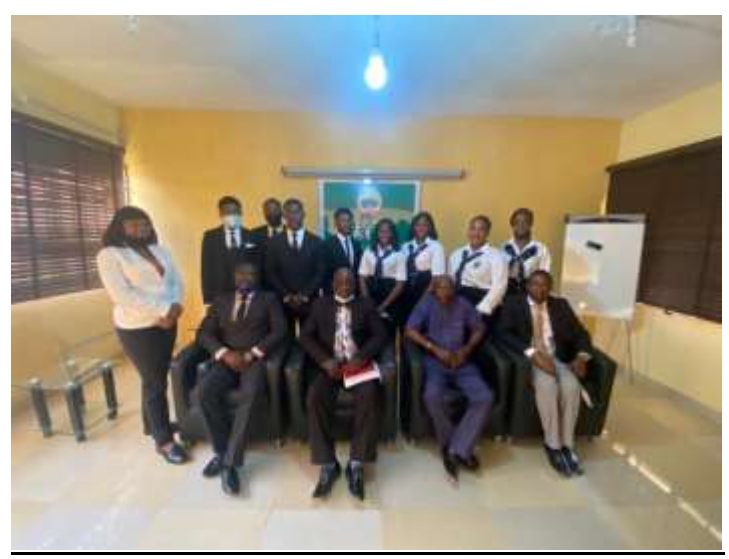
The Solicitor-General, Ekiti State, flanked by staff and student clinicians