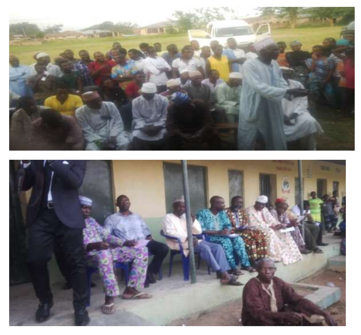
A cross section of participants at the sensitization