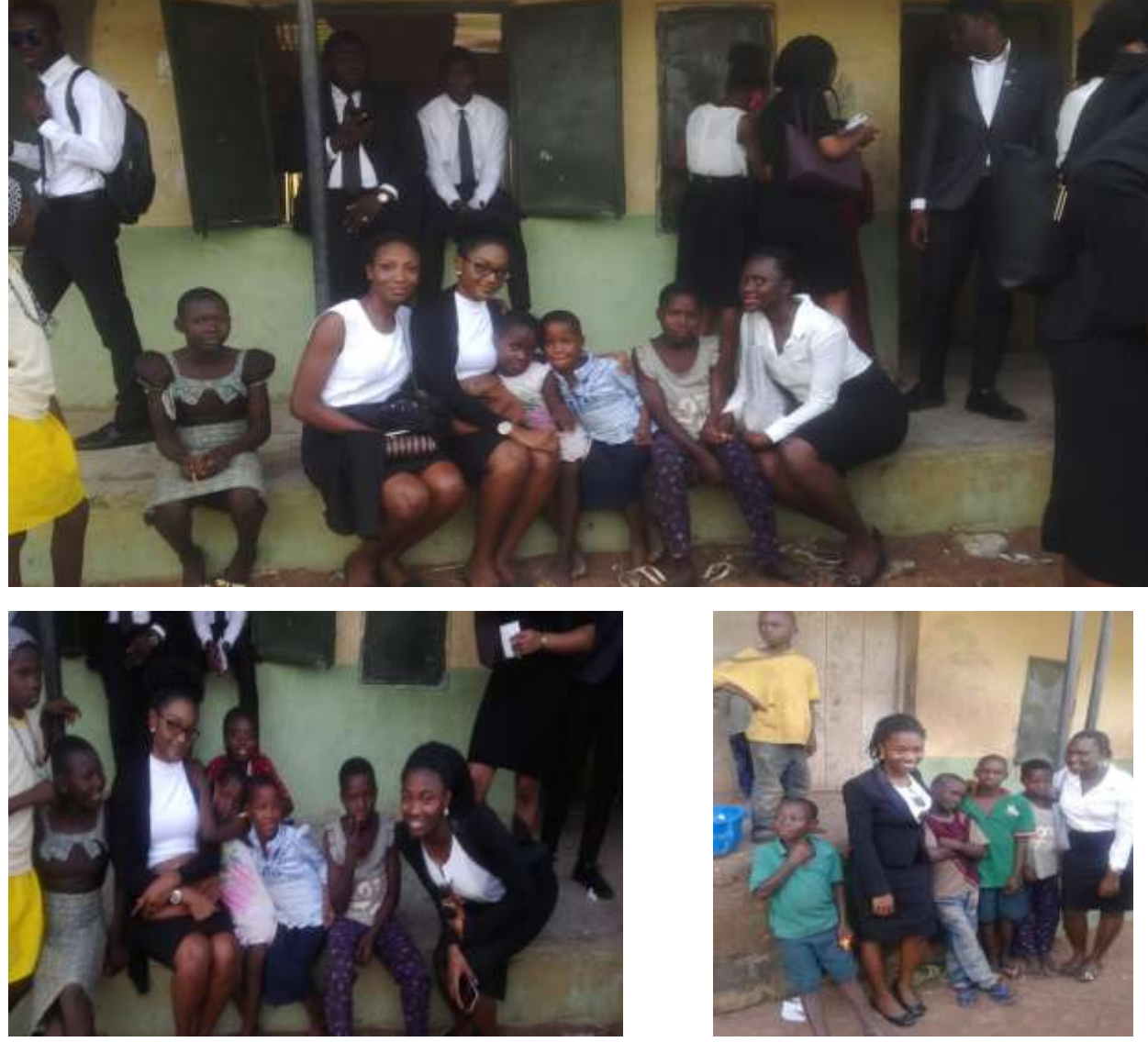
Student clinicians posing for a snap shot with children in the community