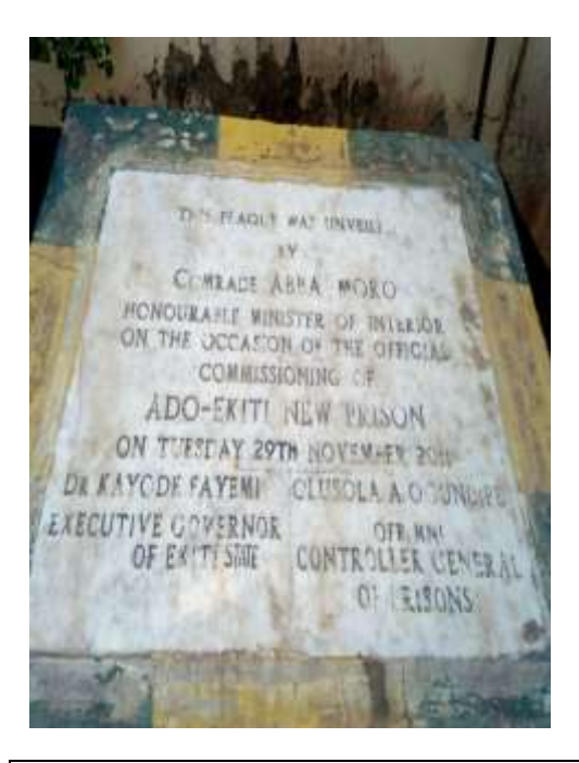
Nigerian Prison Service, Ado-Ekiti