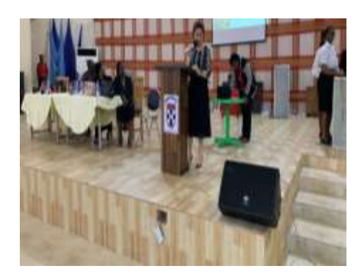
The Vice Chancellor, ABUAD, delivering her address

Students asked insightful questions which were addressed by members of the panel.