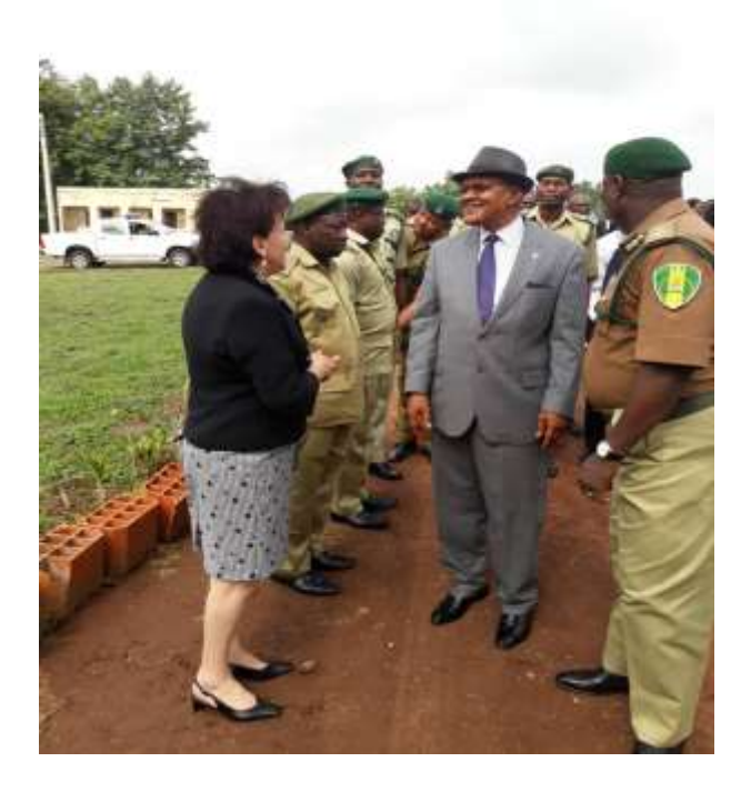
The Vice Chancellor, ABUAD and Former Director of the ABUAD Law Clinic