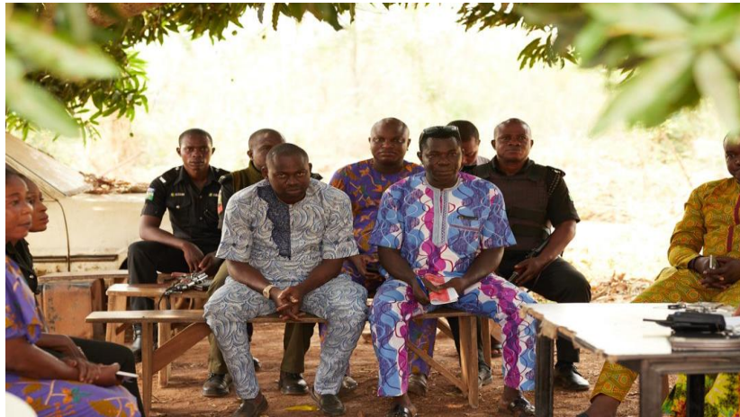
Police officers listening to and watching the presentation

At that seminar, a talk was also delivered by the Administrator of the Law Clinic concerning the new provisions contained in the Law. He emphasized on the need to inform suspects about the crime they are alleged to have committed as well as their rights to remain silent and to counsel at the point of arrest. Twenty police officers were in attendance including the highest ranking officer at the station, the Divisional Police Officer (DPO).