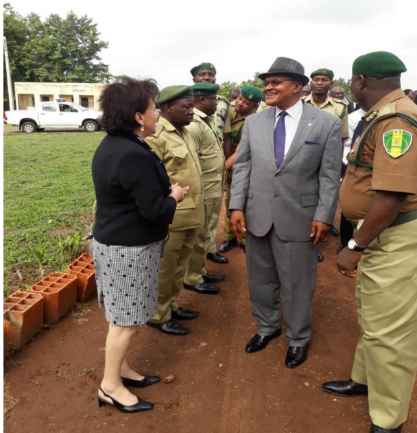
The Provost of the College of Law and Director of the ABUAD Law Clinic