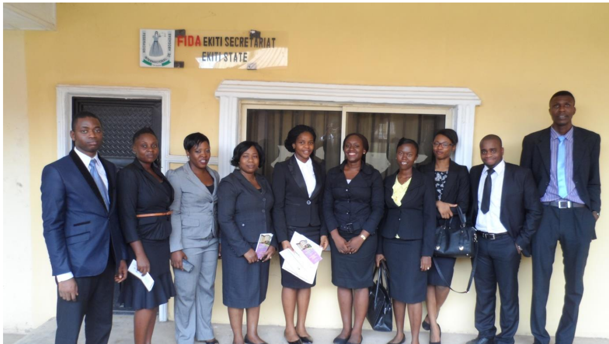
ABUAD clinicians and Executives of FIDA

FIDA agreed to collaborate with the ABUAD Law Clinic in the area of workshop as it has agreed to invite and carry clinicians along in the FIDA week. The Association has also agreed to collaborate in the area of ADR by allowing students participate in mediation sessions taking place at their office. The Law Clinic may, subject to the approval of relevant authorities, seize the opportunities made available by FIDA.