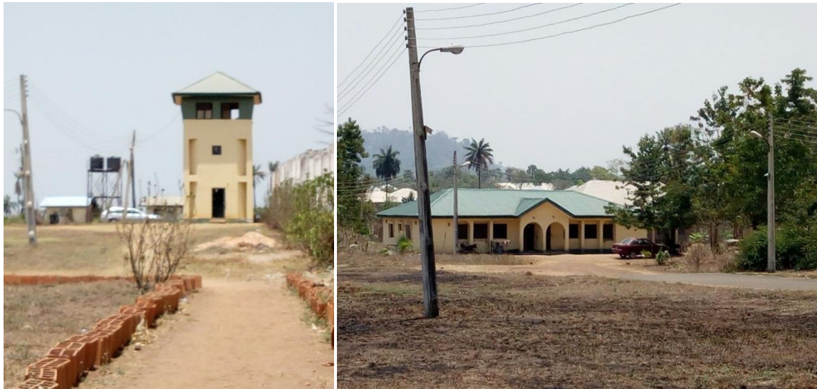
Some of the Prison's infrastructures.