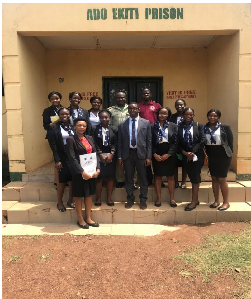
Staff & Student-Clinicians at Ado-Ekiti Prisons