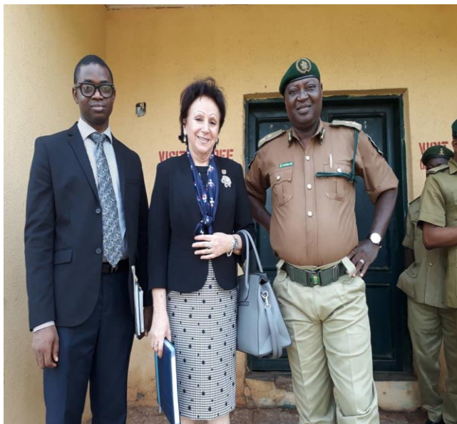
The Provost flanked by the Administrator of the Law Clinic and the Deputy Controller of Prisons