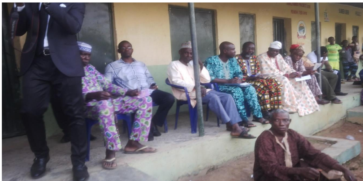
A cross section of participants at the sensitization