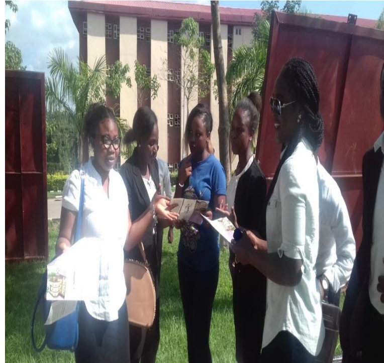
Student-Clinicians carrying out sensitization amongst colleagues