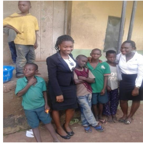
Student clinicians posing for a snap shot with children in the community