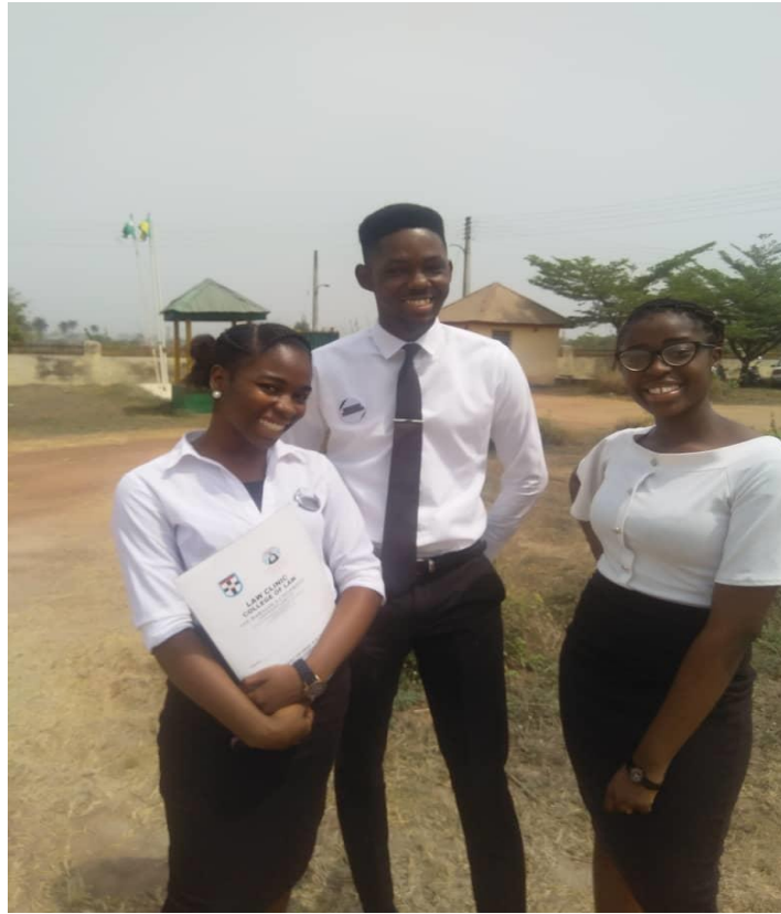
Student-Clinicians after delivering a letter at the Prison Headquarters