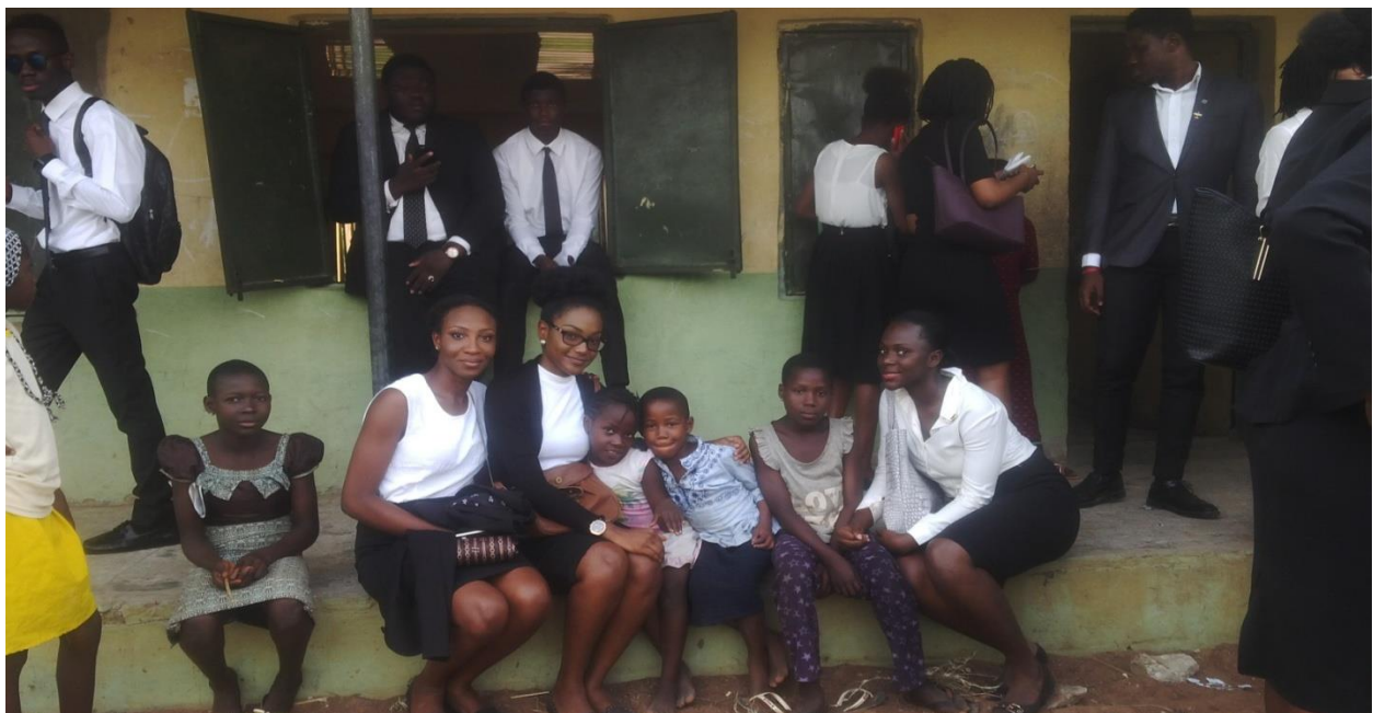
Student-Clinicians during an outreach at Erifun Community.